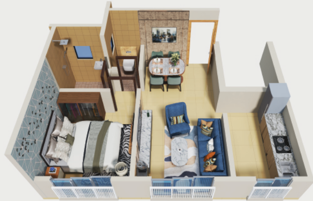
1 BHK FLAT