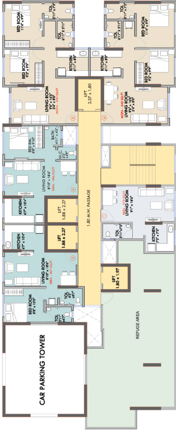
TYPICAL 8TH(REFUGE) FLR PLAN