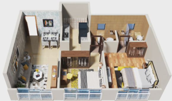
2 BHK FLAT